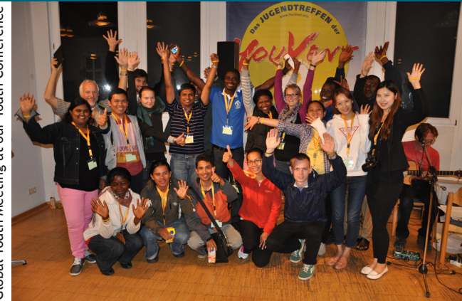
Global Youth Meeting at our Youth Conference

three regionally oriented ministers. One person is commissioner for church development service. There are three ecumenical co-workers from overseas partner churches.