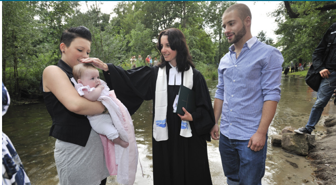
Baptism along the Rhine River

Baden is situated in the south-western part of Germany. Politically it is part of the federal state Baden-Württemberg.